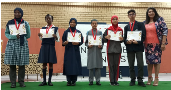
AWARDEES @ SPEECH CONTEST 2024