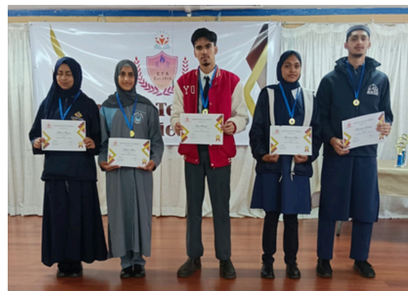
AWARDEES @ SPEECH CONTEST 2025