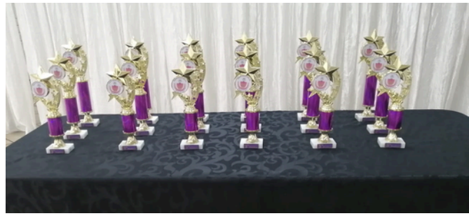
TROPHIES @ ETS NEWSPAPER QUIZ 2025

AL- AQSA X1 AL- AQSA X5 AL – HUDA ACADEMY ALPHA PRIMARY CROSBY ACADEMIC PRIMARY SCHOOL FLAMINGO PRIMARY GREYVILLE PRIMARY HARMONY PRIMARY IMPALA PRIMARY LENASIA MODEL SCHOOL LENASIA MUSLIM SCHOOL LIBRA PRIMARY SCHOOL LOTUS SCHOOL OF EXCELLENCE NIZAMIYE PRIMARY SCHOOL- MAYFAIR NIZAMIYE PRIMARY SCHOOL- MIDRAND PARK PRIMARY PENTAROSA PRIMARY PROGRESS PRIMARY QURTUBA ISLAMIC ACADEMY REDWOOD PRIMARY (LENASIA) REDWOOD PRIMARY (ORMONDE) RIDGEWAY MUSLIM SCHOOL- PRIMARY SIERRA NEVADA PRIMARY ZODIAC PRIMARY